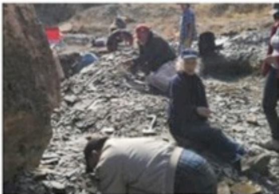
More Folks Hard at It