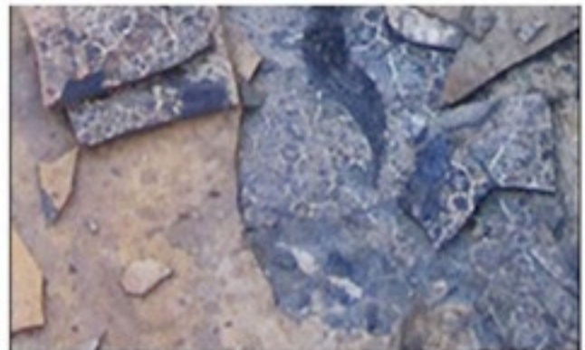
Fish Fossil (top center)