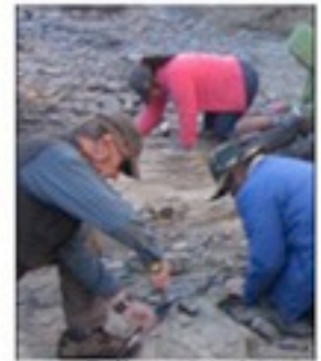
Folks at Work