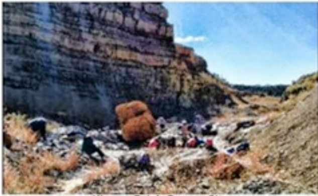
Kinney Brick Quarry Site