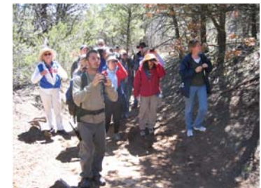
This group enjoys bird watching on one of our trails, during one of our public program days.

The Sandia Mountain Natural History Center is opening its doors to the public the first Saturday of every month from 9:00 a.m. – 3:00 p.m. from March through September. Each Saturday program will include a self-guided hike, two hands-on exhibit rooms, a bird viewing deck, as well as an education session. Education sessions will begin at 10:00 a.m. These programs offer an inexpensive way to experience the Sandia Mountains that is fun for the whole family. Visit us at www.nmnaturalhistory.org/smnhc for current listings.