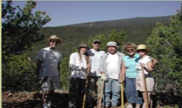
SMNHC Volunteers constructing a new trail.